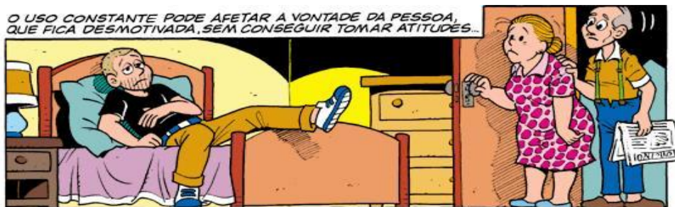
Picture 9 - Drugs effects

Resource: Comics a Story that needs an end.