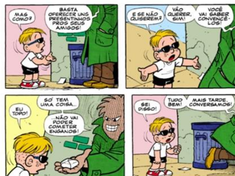
Resource: Comics a Story that needs and

Concatenated in a gradual sequence that equals use to trouble use and addiction – another common resource among the educational prohibitive material – it strengthens a more alarming function than a preventing one keeping invisible real forms of propagation of the use among kids and younger.