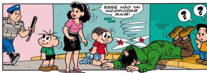
Picture 12 - Monica assaults the drug dealer

Resource: Comics a Story that needs an end.